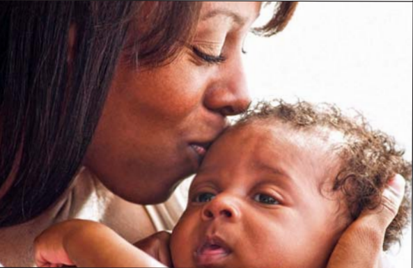
All services are free and confidential Mon & Tue 1:30-4