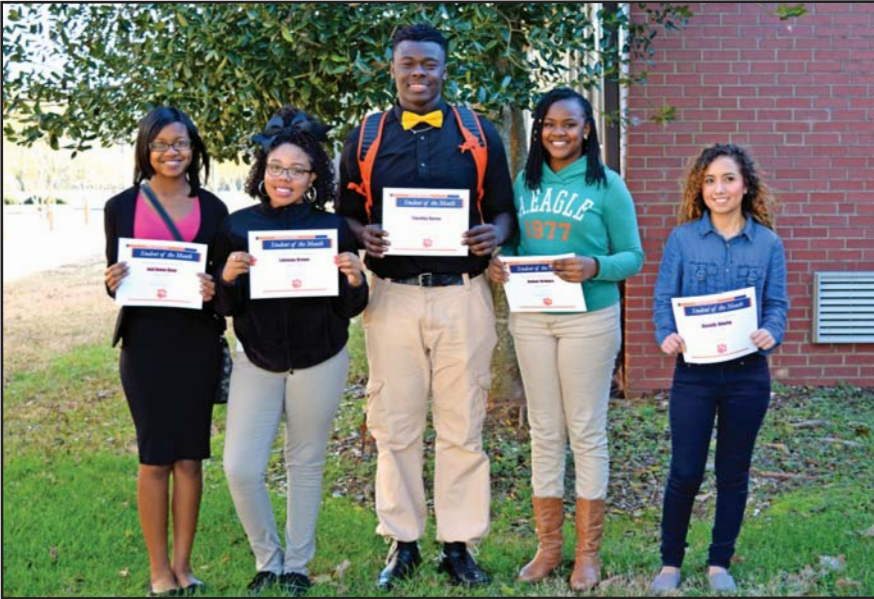
Anson High School Students of the Month for December and January.