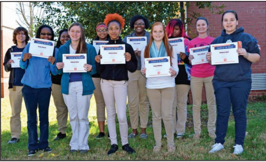
Anson High School Students of the Month for November and December.