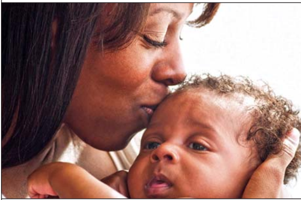
All services are free and confidential Mon & Tue 1:30-4