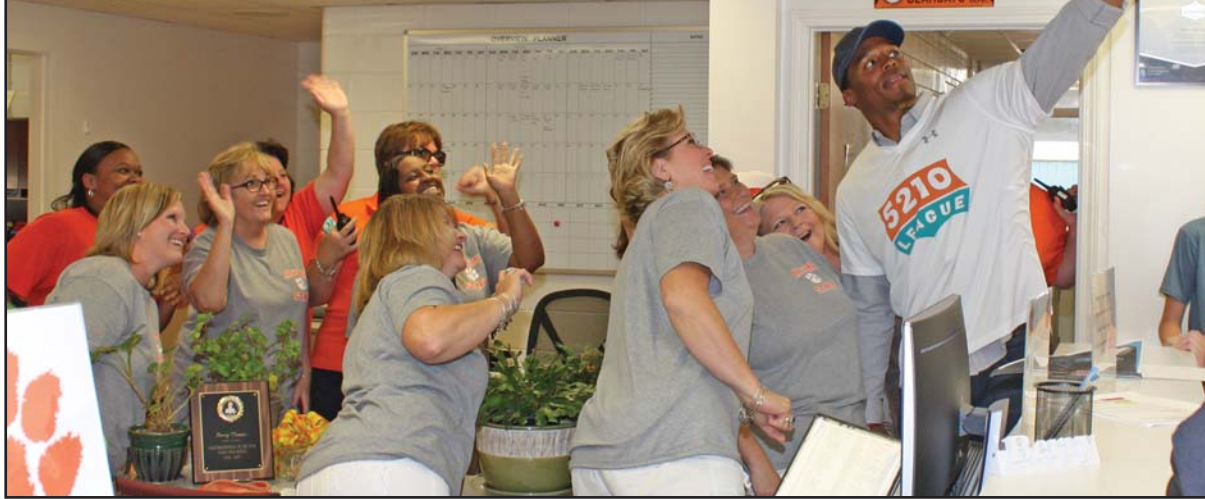
More pictures are on page 6