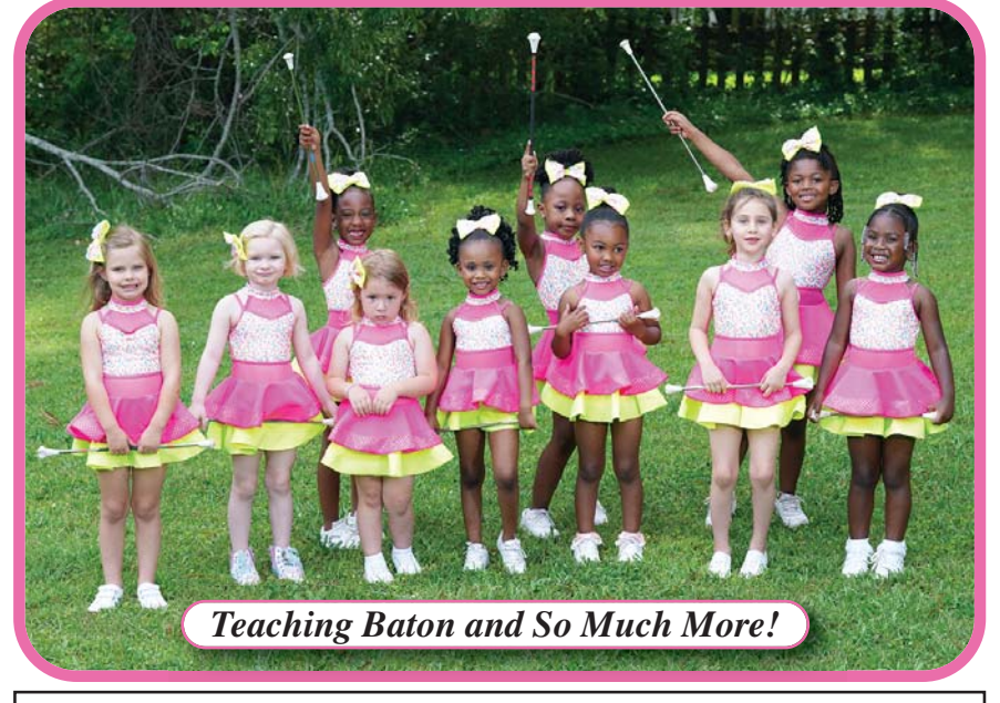
Teaching Baton and So Much More!

MARTIN FURNITURE FACTORY OUTLET Highway 74 West in Wadesboro • 704-694-3185