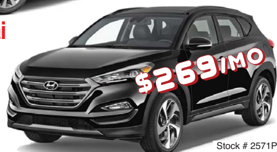
2016 Hyundai Tucson LIMITED Stock # 2571P

$1500 down cash or trade. 722 or higher Beacon Score for these examples. Must be 18 years or older. Other options available as needed. With approved credit. Certain conditions apply. See sales staff for details. Price does not include tax, tag, title or fees.