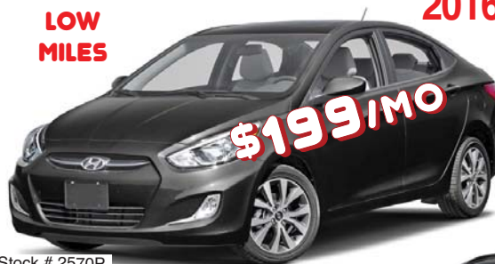
2016 Hyundai Accent SE Stock # 2570P