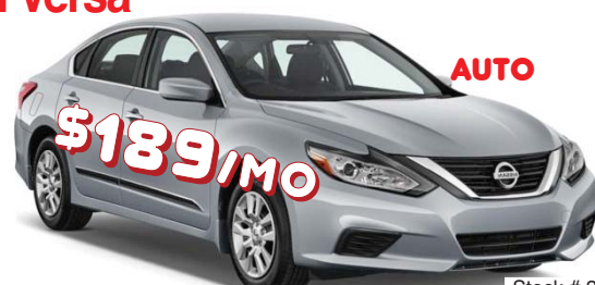
2016 Nissan Altima Stock # 2572P