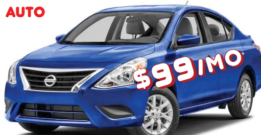
2016 Nissan Versa Stock # 2567P