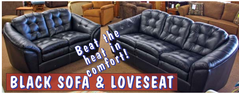
BLACK SOFA & LOVESEAT