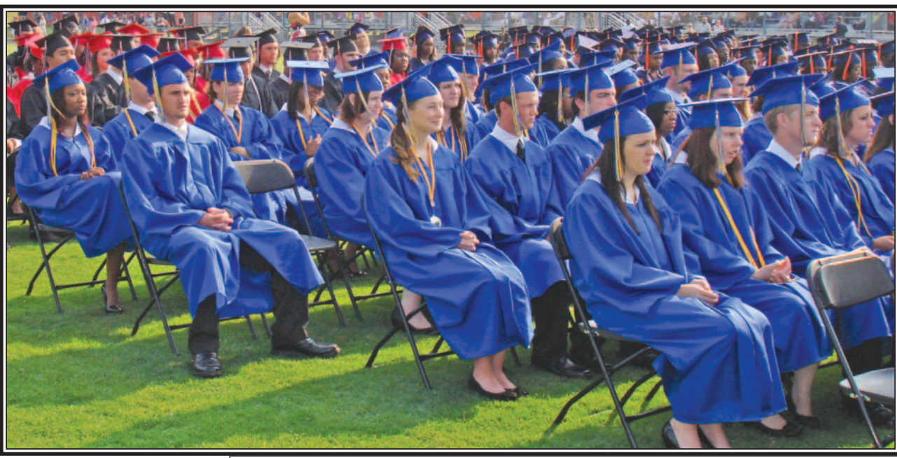
Graduates from Anson County Early College listen intently to their Valedictorian.