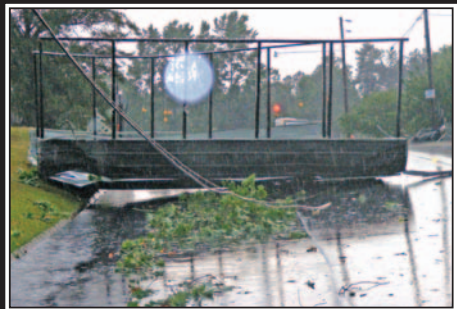
Pardon me, have you seen my carport? This carport ended up laying upside down on the road in Lilesville.

The National Weather Service (NWS) has said that this storm did not appear to be a tornado, but what is called a downburst. Downbursts are defined as strong winds produced