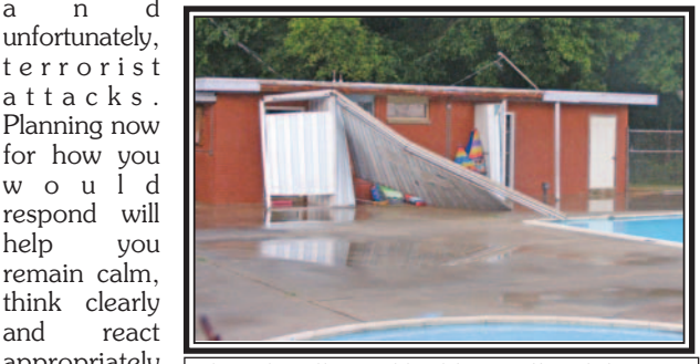
The Lilesville Pool building suffered damage.

by a downdraft over a horizontal area up to 6 miles (10 kilometers). Downbursts are further subdivided into microbursts and macrobursts. Diggs added, "With the severe weather that is happening across the United States and hurricane season upon us, Anson County Emergency Management is encouraging everyone to be safe and prepared for storms. We never know when an emergency might happen. They come in the form of severe weather, accidents,