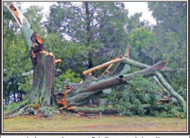
A destroyed tree on 5th Street in Lilesville.

On Monday afternoon July 9, between 4:30 and 5 p.m. a severe thunderstorm moved across Anson County, keeping fire, rescue, EMS and law enforcement crews busy throughout the evening. This storm had strong winds, heavy rain and hail associated with it. The storm caused trees to fall across the county creating power outages. The heavy rain created flooding of roadways and small creeks.