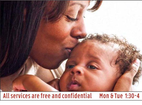
All services are free and confidential Mon & Tue 1:30-4