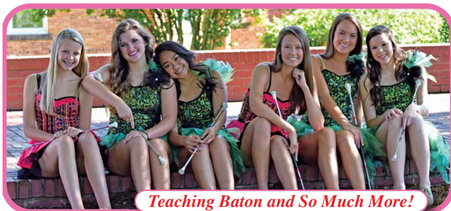
Teaching Baton and So Much More!

Contact the Cheraw Arts Commission 843.537.8420 x 12 to pre-register for the workshop or to receive additional workshop information.