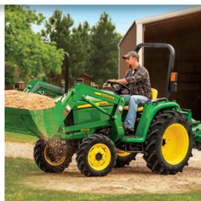
3E Series Tractor Package

We're dedicated to providing affordable, hardworking solutions that help make small work of big jobs. Dependable and loaded with features for every budget, our equipment will help you tackle chores easily, so you can get on with your day.