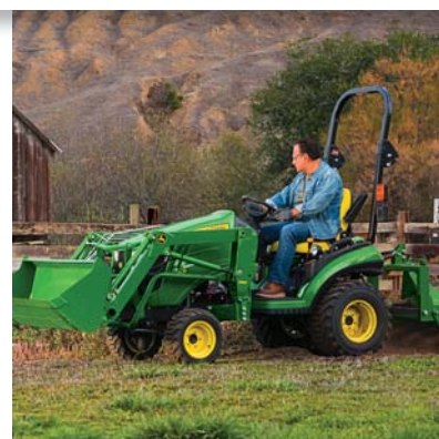
1 Series Tractor Package