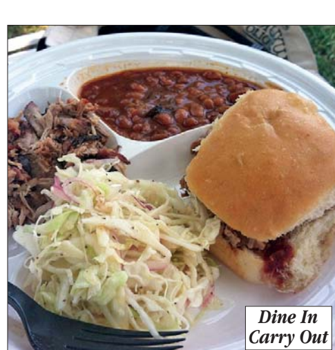
Dine In Carry Out

No documentation needed 1st come, 1st served 704-695-2879