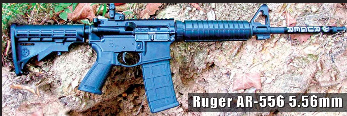
Ruger AR-556 5.56mm

The public is invited to visit the Burr Gallery and attend the History Talks. Gallery Hours are Monday-Friday - 8:30am-5:00pm. Contact the Cheraw Arts Commission 843.537.8420 x 12 for additional information.