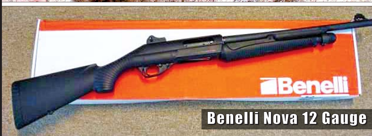
Benelli Nova 12 Gauge