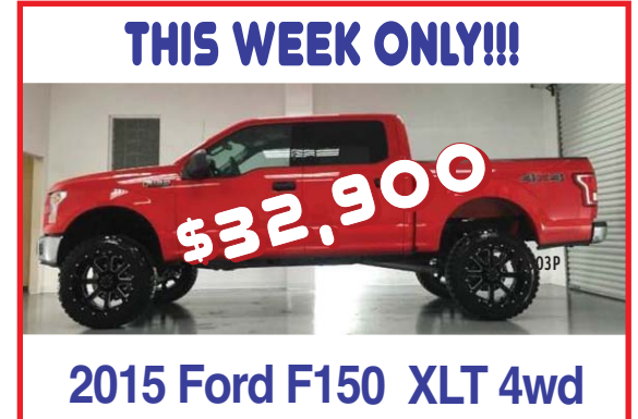
2015 Ford F150 XLT 4wd