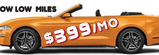
2019 Mustang EcoSport Premium Convertible