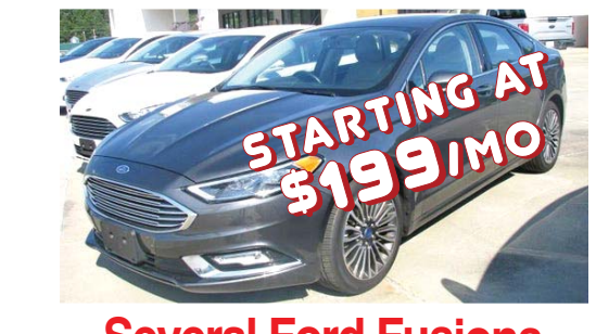
Several Ford Fusions