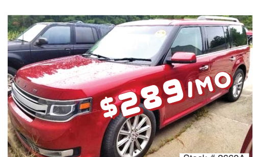
2015 Ford Flex Limited