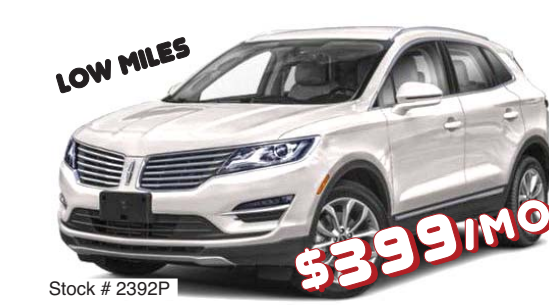
2018 Lincoln MKC Select PRICED TO MOVE QUICK!!!