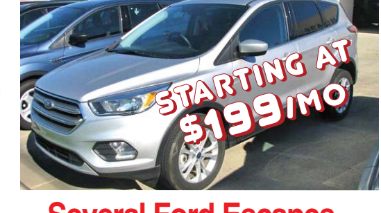
Several Ford Escapes