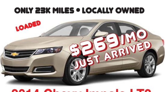
2014 Chevy Impala LT2

2019, 2018, 2017 3.99 APR 75 mos, 2015 Flex 5.99 APR 60 mos, 2015 F150 3.49 APR 72 mos, 2012, 2011 99 APR 48 mos. WAC. Certain conditions apply. See Marty or Randy for details. Price does not include tax, tag, title or fees.