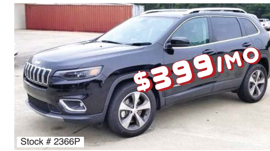
2019 Jeep Cherokee Limited