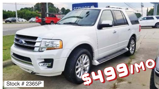
2017 Ford Expedition Limited