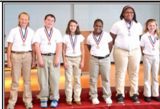
Pictured here are the Essay Winners at AES.