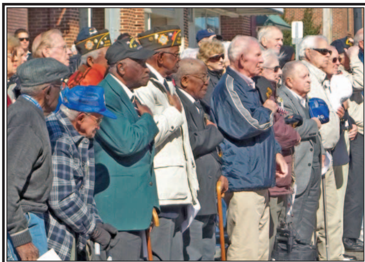
Pictured here are some of the World War II Veterans who were honored during the Veteran's Day Ceremony in Wadesboro.